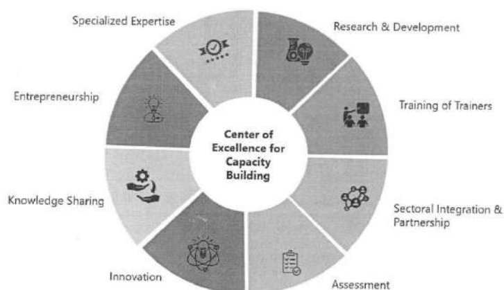
Figure I: Features of Centre of Excellence (CoE)